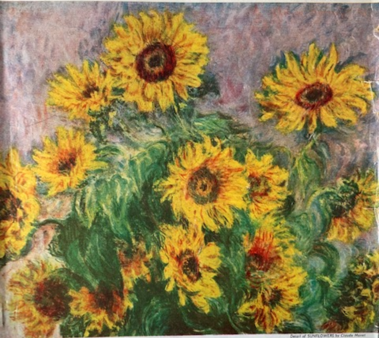
Detail of SUNFLOWERS by Claude Monet